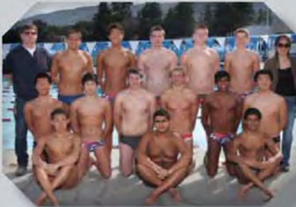
Boys Varsity Swim Team