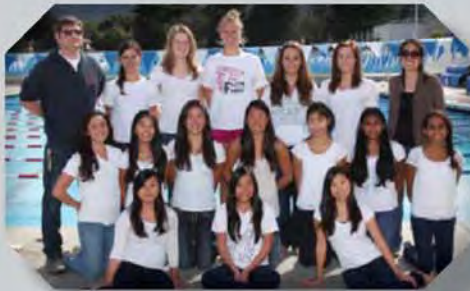
Girls Varsity Swim Team