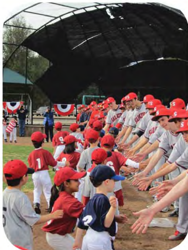
Baseball Opening Day