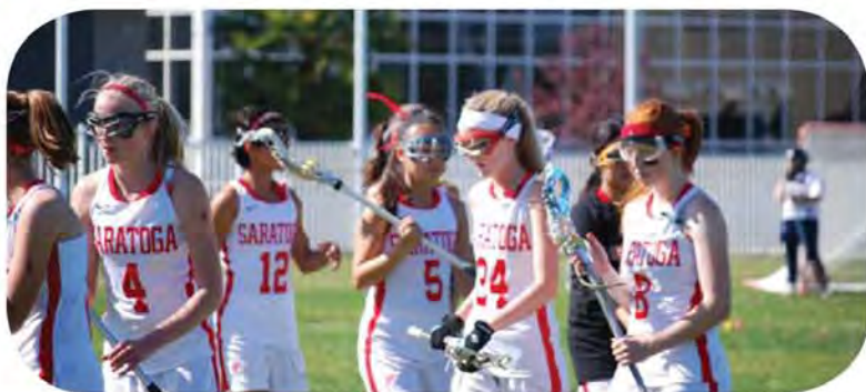
Girls' Varsity Lacrosse