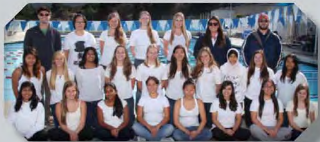
Girls JV Swim Team